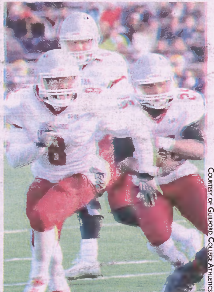
Guilford College Quakers at their last game of the season at Emory & Henry College, where they won 52 - 28.