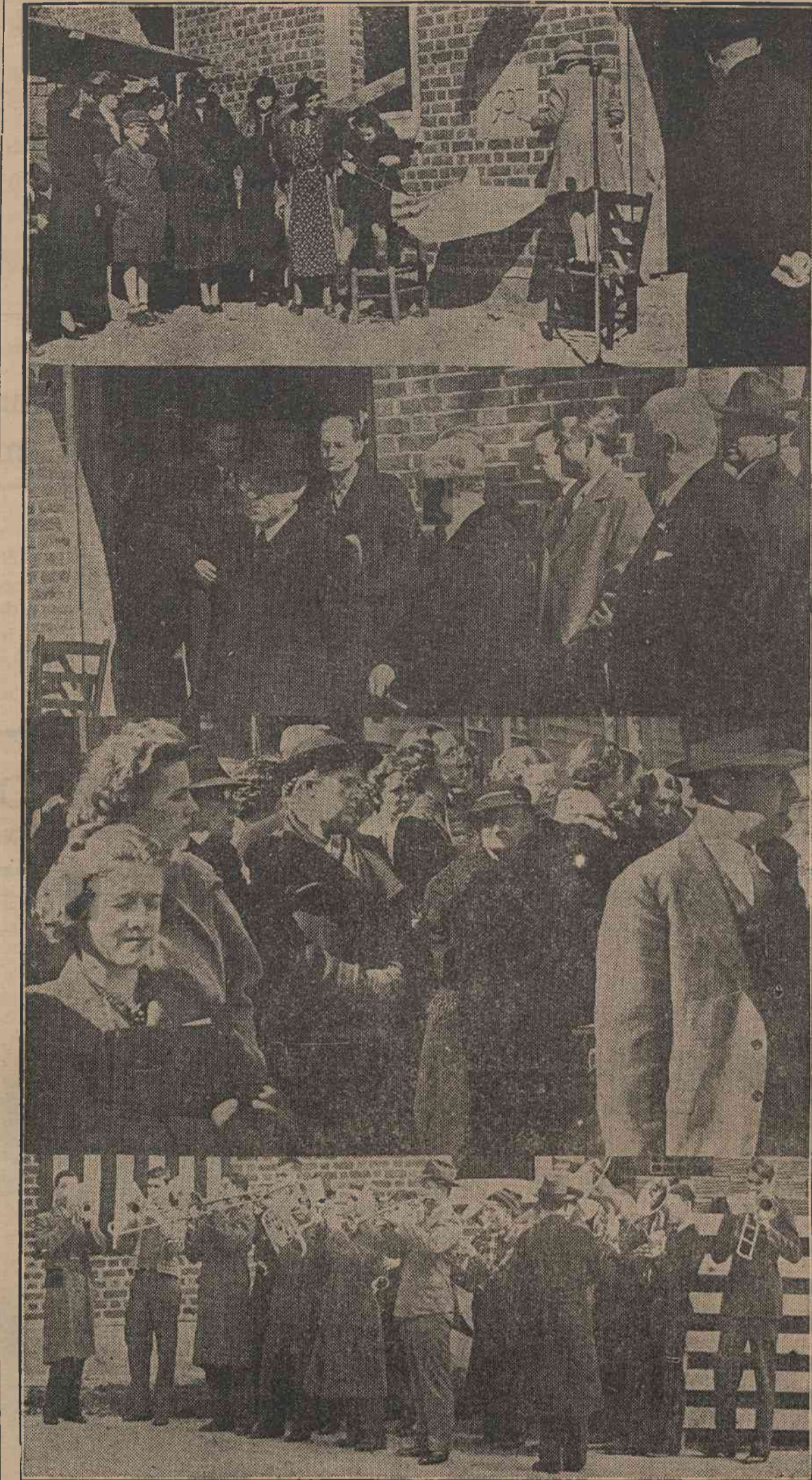
SCENES TAKEN DURING THE DEDICATION PROGRAM OF THE HALL OF HISTORY.

"It might be interesting to the news release to state that the University of Southern California College of Commerce has a course termed 'Personal Financial Planning' in which the student learns how to expend his money wisely after he graduates. The course is in no way purely a study in budgeting, for the lecturers, borrowed from all departments of the College of Commerce, teach the students the fundamentals of what it costs to live, how to buy food and clothing, how and when to buy an automobile, renting versus owning the home, how and when to buy a home (cost of it, construction and necessary precautions), how to purchase professional services (medicine and legal), and other subjects that will eventually stub every college student full in the face. In addition to teaching students how to spend money, it discusses the ways of establishing an estate for old age by buying real estate, stocks, bonds,