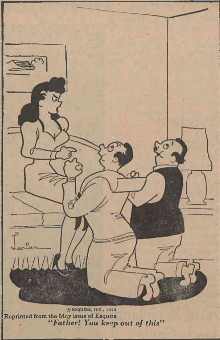
"Father! You keep out of this"

Germany —In the American zone the University of Heidelberg was the first German university to liberate itself and reopen on August 27, when first-year medical courses were started. The medical colleges of Marburg and Erlangen have also reopened. 200 students and 18 professors were assigned to each of these 3 schools, after a screening process. The Universities of Frankfurt, Giessen, Wurzburg and Munich