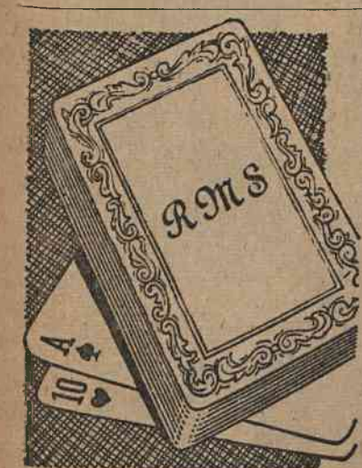
Immediate Delivery MONOGRAMMED CONGRESS PLAYING CARDS $2:00 Double Deck