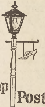
Lamp Post creations 422 W. 4th St.