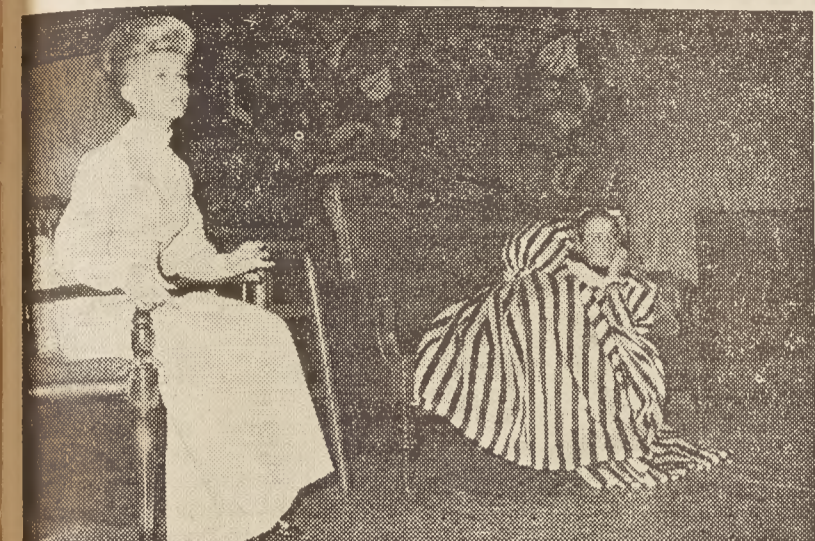
The Pierrette crew and cast go into the final week of preparations for Hedda Gabler.

Technical work for the Pierrettes' fall production, Hedda Gabler by Henrik Ibsen, is nearing completion in the Dramatics Workshop. Over fifty people, a greater number than ever before, have been working on the sets, costumes, makeup, and publicity for the play. New techniques, mainly with character makeup and set construction, are being introduced to improve the technical aspects of the theatre.