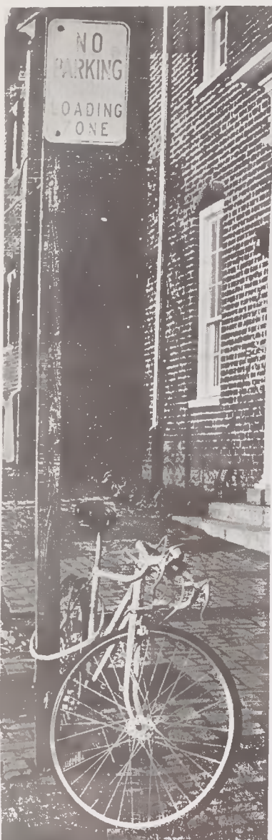
With the arrival of spring, few bicycles hit the "rack."

ELLIS-ASHBURN, STATIONER, INC. NORTHSIDE SHOPPING CENTER SHERWOOD FOREST PLAZA