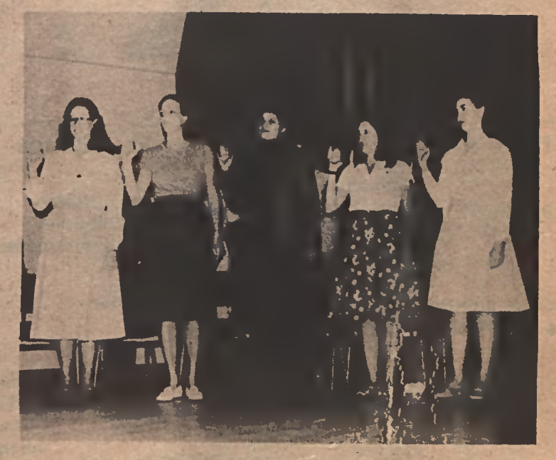
Induction of New Officers

A native of Richlands, she has been at Salem since 1960. Before that, she taught at UNC-Chapel Hill, Catwaba College and several high schools. She is a graduate of Duke University and earned her M.A. degree at UNC-Chapel Hill.