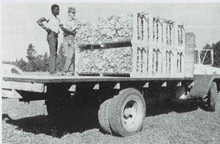
Eight pack house racks loaded on truck ready to go to pack house. These eight racks contain all the tobacco from one curing in bulk barn. Tobacco is compressed in racks to prevent sliding out, and for ease in handling for storing, or ordering.