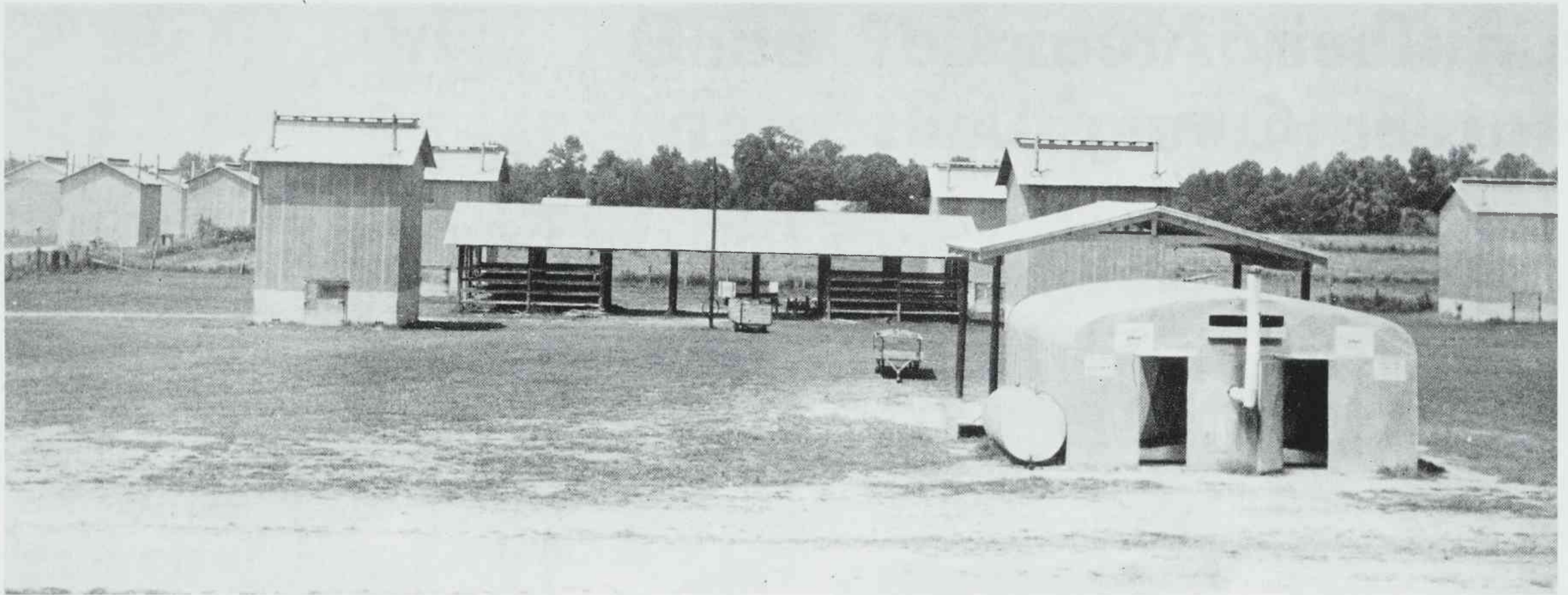
On the Watson Seed Farm, Inc., Rocky Mount, N. C., a Hassler Curing Unit, first one installed in North Carolina in 1961, has been placed near a battery of conventional barns that were in excellent repair and equipped with good burners and ventilators.