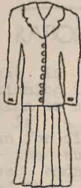
MISSE S SIZES