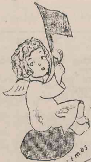
A Joyous Christmas

Three seniors who are driving now will have to be replaced next year.