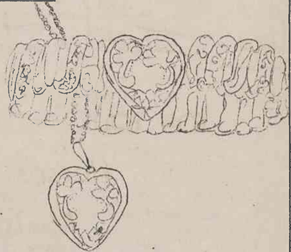
Matching Bracelets and Necklaces