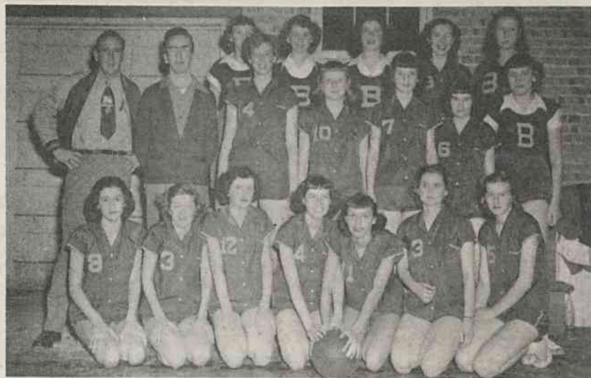
GIRLS TEAM GOES INTO SEMI-FINALS