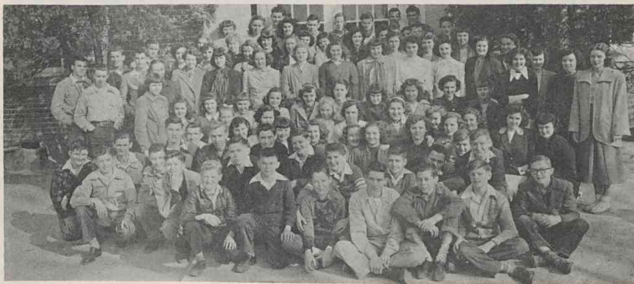
HAPPY CAREFREE DAYS - JUNIOR HIGH