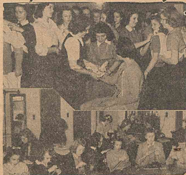
The pictures above were snapped at the knitting and first aid classes. Evidently GHS girls are getting ready to play an important part in defense.