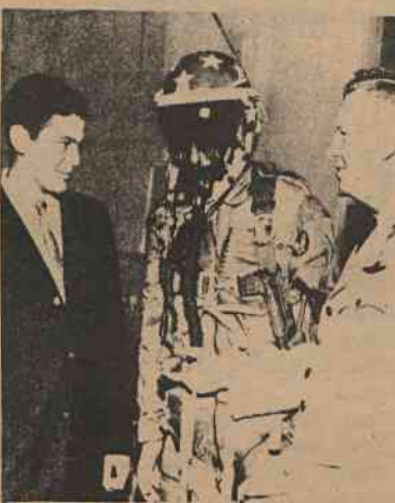
The Air Force graduate who qualifies for pilot training may look forward to the most thorough and exacting instruction.

To be eligible for consideration for Regular NROTC status, you must; be a male citizen of the United States; have reached the 17th anniversary of your birth by June 30, 1963; have not reached the 21st anniversary of your birth by June 30, 1963; be un-married and never have been married; be physically qualified in accordance with the standards prescribed for Midshipmen; be a high school graduate or possess