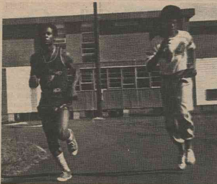
RUN FOR FUN: Two of the twenty Cross Country runners running for fun.