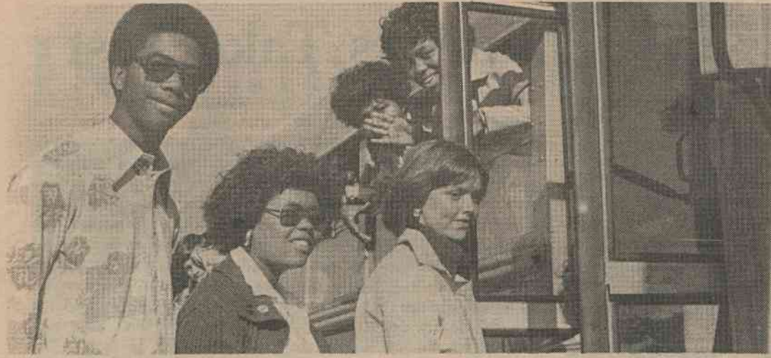
STUDENTS BOARD — Senior Psychology students board the bus for their trip to Wesleyan College.