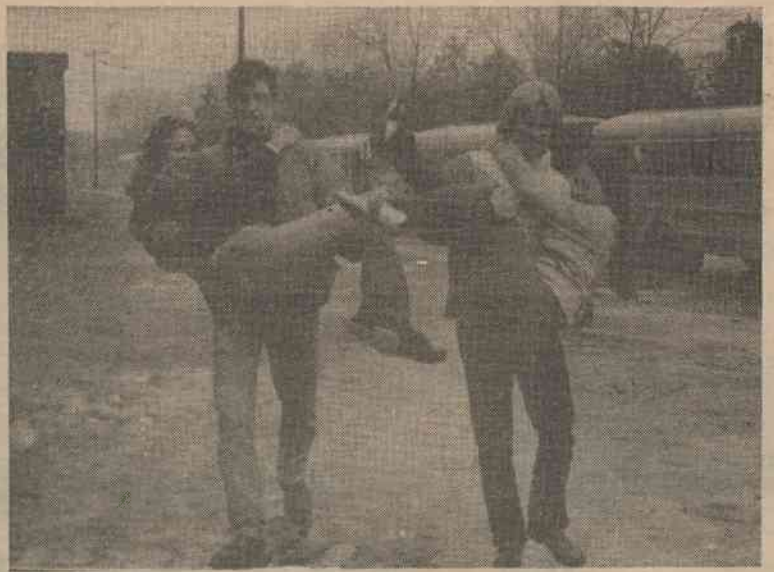
SPLISH SPLASH: Students trudge through flooded school grounds. Heavy rains and freezing winds prevailed.

Most American motorists want to keep the national speed limit at 55 miles per hour, the Transportation Department says, citing nine surveys conducted by local, state and national organizations.