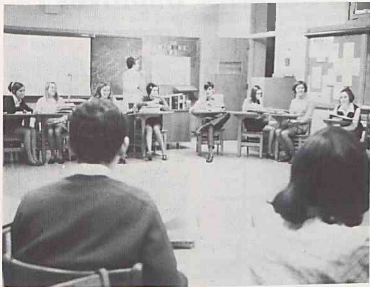
Seniors plan mini-courses for beginning of second semester.