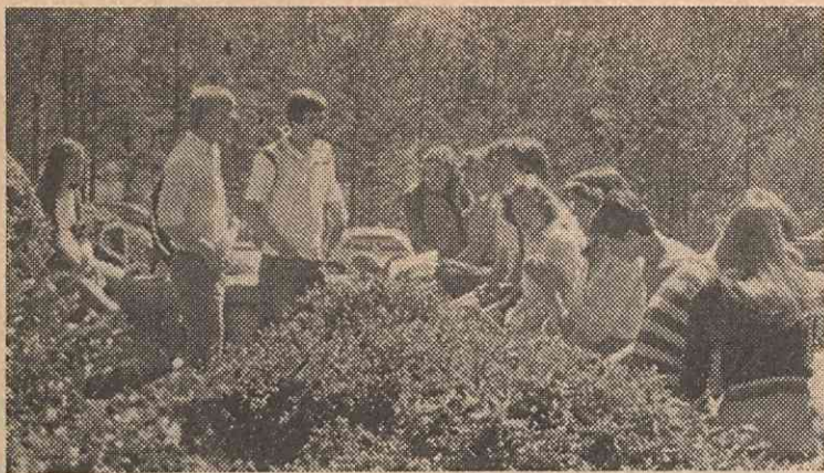
Second lunch students gather along the wall.