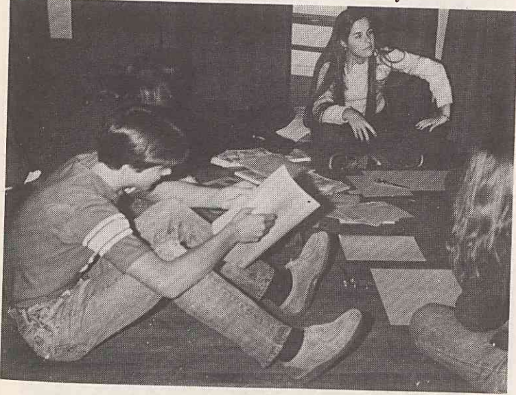
Advisor instructs decoration committee