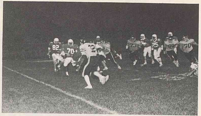
Albemarle's offense moves the ball.

For the last five minutes of the ball game the "Real Dogs" defense was backed up into their own territory. They played an extremely tough defensive game to prevent East Rowan from scoring. Some of the penalties also hurt the Bulldogs. After holding off East Rowan on fourth down from the three yard line the ball was turned over to Albemarle. Albemarle had the ball for twenty seconds. The final score was Albemarle 14, East Rowan 12.