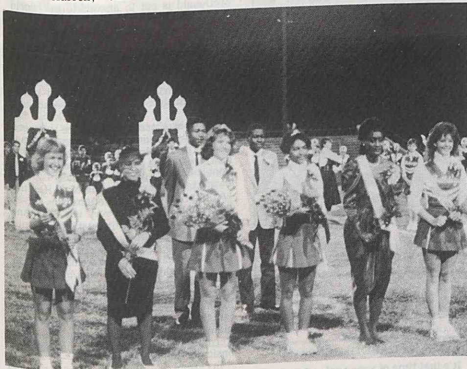
The 1986-87 Albemarle Senior High Homecoming Queens.

The 1986 Homecoming is another in the long list of great homecomings at Albemarle Senior High School. Congratulations to the winners and thanks for some more homecoming memories.