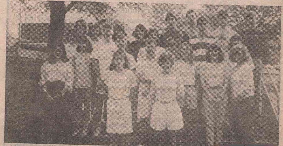
AHS seniors will receive special recognition for academic excellence at banquet on