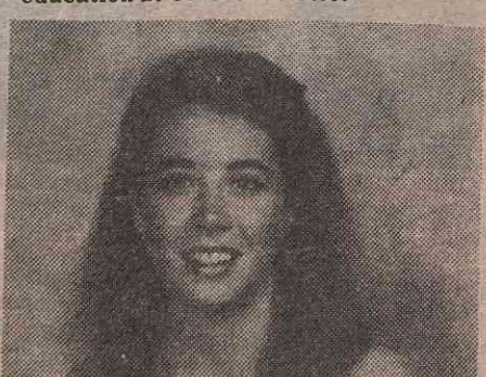
NCSU awaits the arrival of future