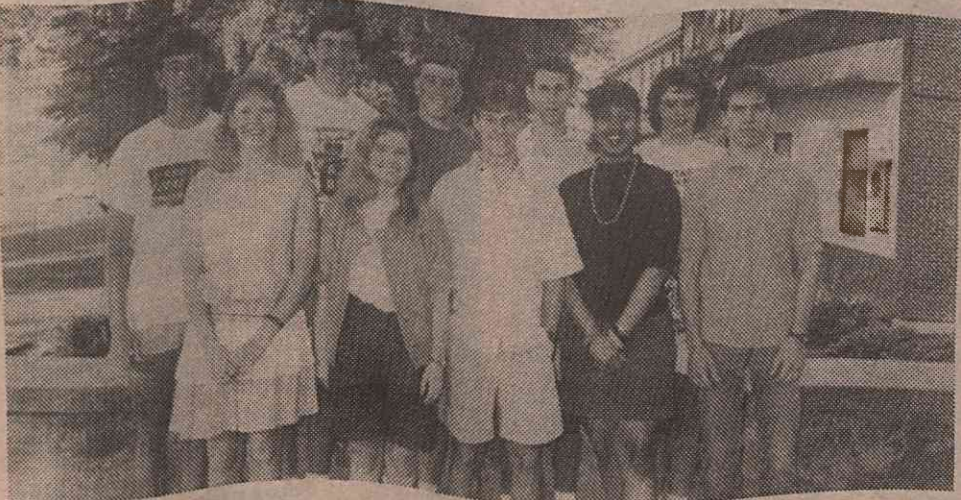
Marshals play an important role in the graduation ceremony.