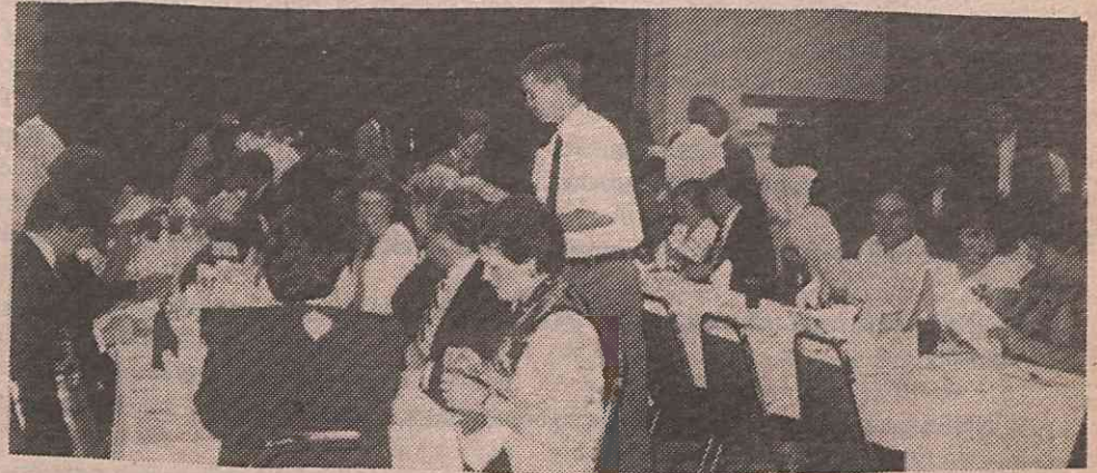
Parents, faculty members, administrators, and community representatives all attend the banquet to honor outstanding seniors.

This banquet is coordinated by a faculty committee in conjunction with a local Schools-Community Committee, which arranges financial support from local businesses.