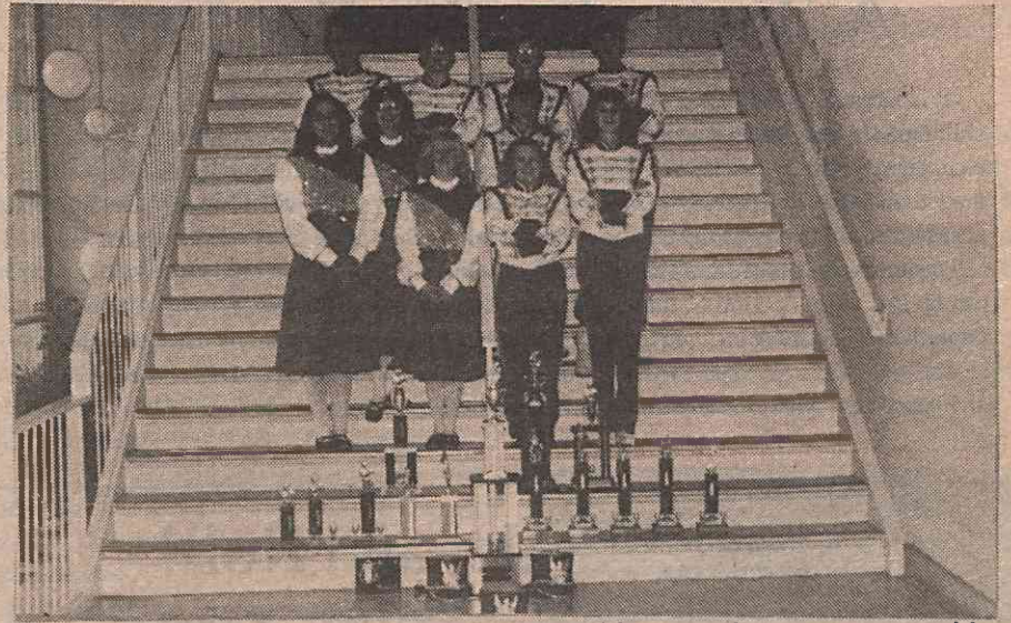
The AHS Band officers show off the many trophies won in recent competition.

Traveling to Newton-Conover High School on November 4, the AHS band was one of 26 bands participating in the Southeastern Classic. During this competition, the band received its highest score ever, an 89, and another Superior rating. The rifles, drum major, color guard, and drum line all received first place ratings. The drumline received a second place rating. Thank you, band, for your efforts in representing AHS during these weekend contests!