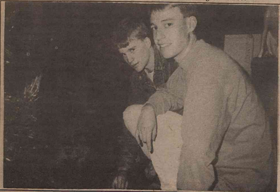
The animals of AHS, Wes and Sonny, feel at home with the animals on display.