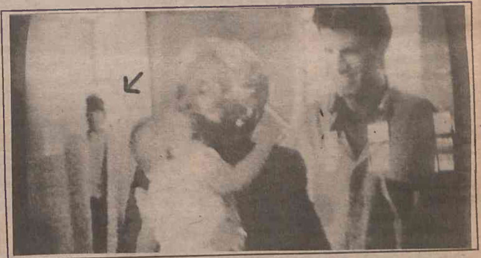
Find the arrow and you'll see the "ghost"!

I have to admit that I saw the movie and the ghost. I was scared to death. Some people think that it is a fake and that the whole thing is a studio publicity stunt to stimulate sales of the video tape. Others think it is just one of those unexplained things that happen. Whether or not you believe me, you must get the movie and watch the part for yourself; then you can be the judge.