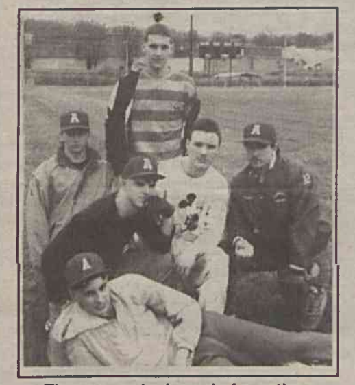
These guys look ready for action, don't they?

The guys have also started impressively. Bill