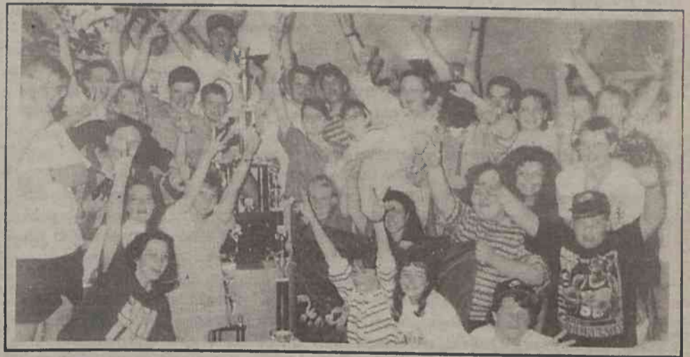
The band students celebrate after winning Festival in Williamsburg, Virginia, a great finale to their very successful year!

The Albemarle High School Band has represented our school in a very dignified way. Congratulations for a job well done.