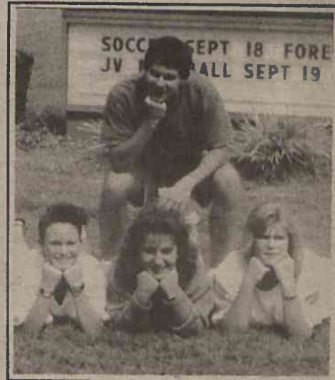
Get to work, editors!