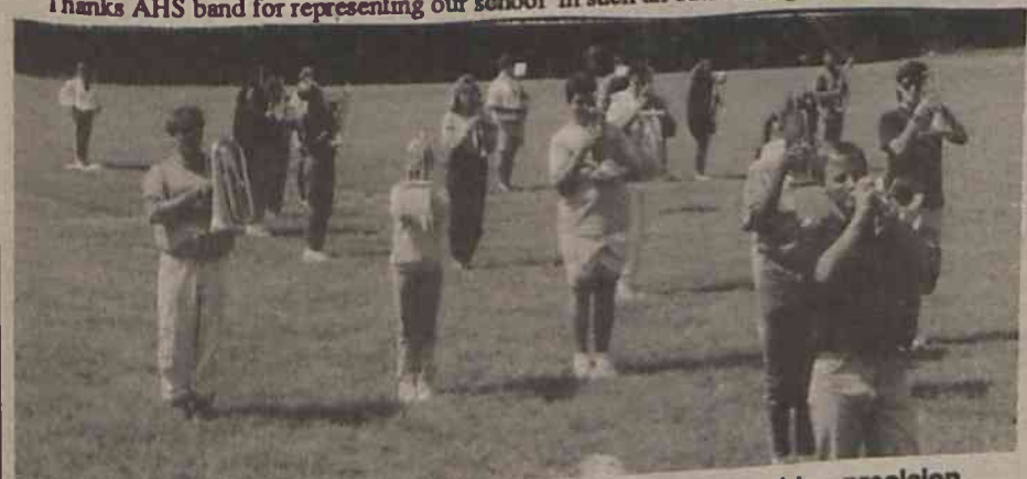
The band works long, hard hours to achieve their marching precision.

Thanks AHS band for representing our school in such an outstanding way!