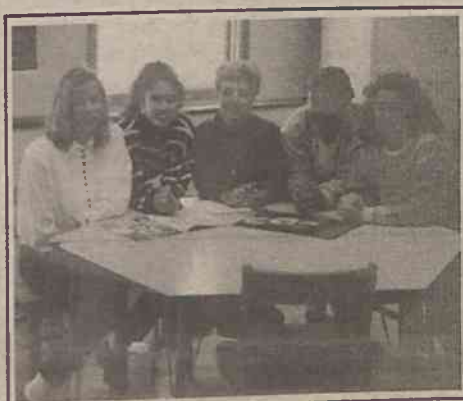
Mrs. Dennis and senior class officers make plans for senior orders day.

Seniors listen up! Tomorrow, Nov. 1, senior materials will be ordered during lunch in the gym lobby. These materials include cap and gown, announcements, name cards, and senior souvenirs. Also measurements will be taken for cap and gowns. A minimum deposit of $40.00 will be due when materials are ordered. If the total order is less than $40.00, the total amount will be due at that time. Don't forget your money!