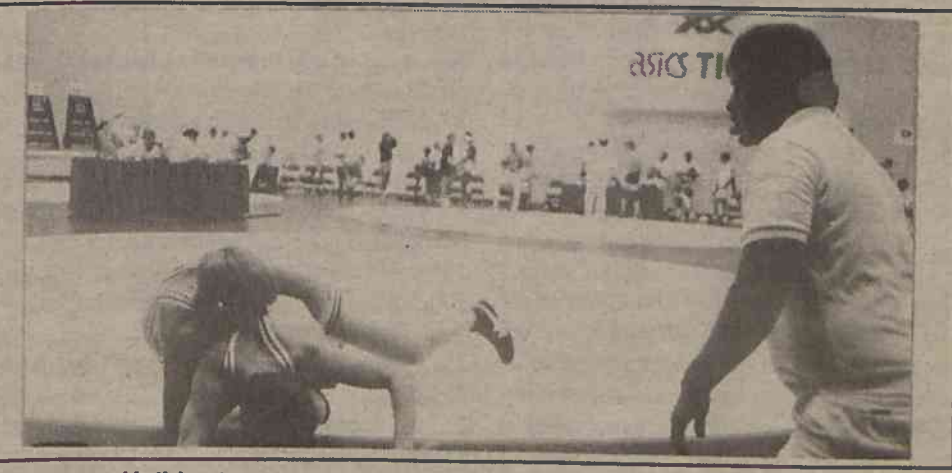
Holiday tournaments provide excitement for wrestling fans.