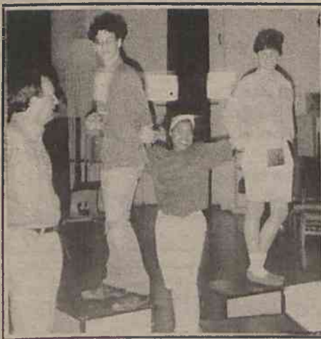
Drama gets ready to entertain us.