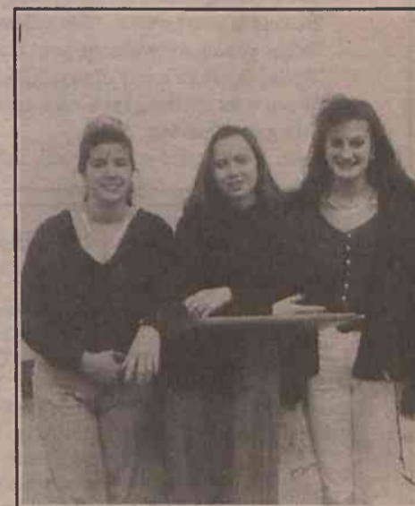
Will these three become teachers at AHS one day?