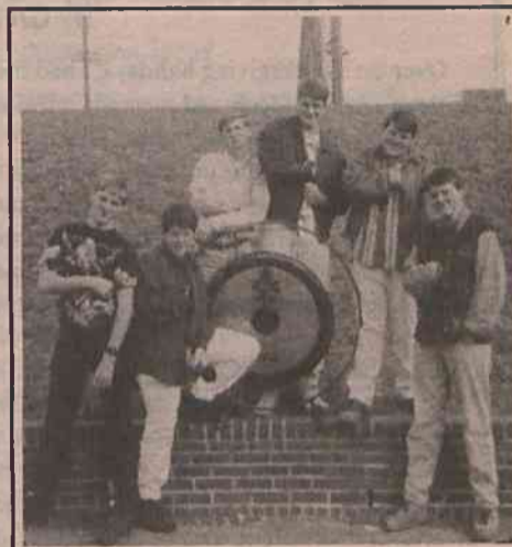
AHS students look forward to the "Gong Show."

Everyone wants to wish all the participants good luck and may the best man or woman win.