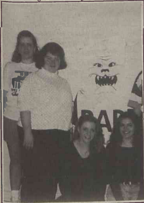
BADD Club members look forward to Prom Promise.