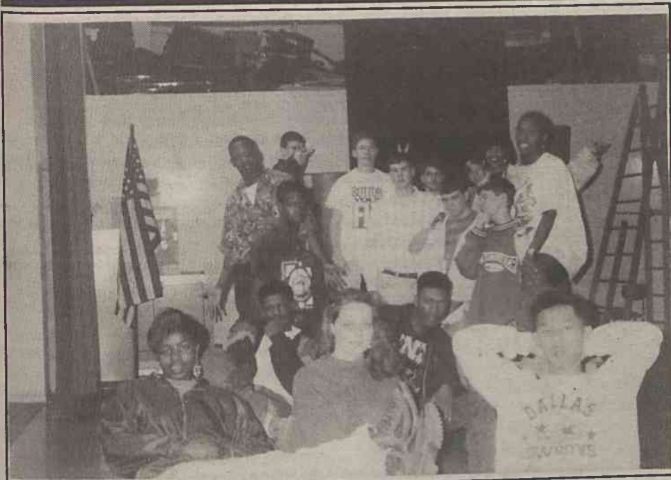
Fourth period drama is working hard to get ready for next month's production.