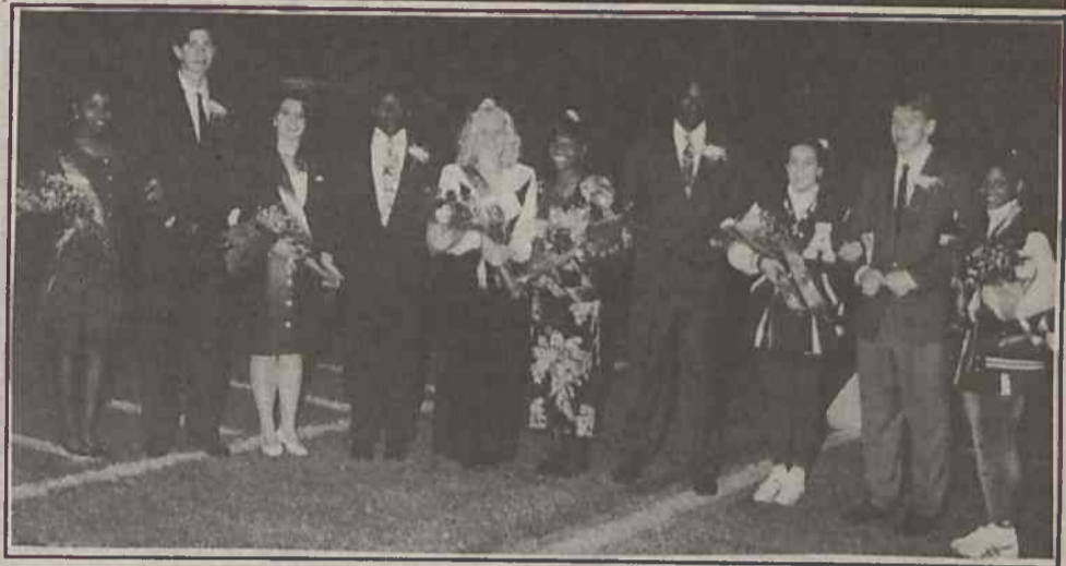
Congratulations to the 1993 Homecoming queens and court!