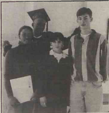
Seniors prepare for June 2.

As the end of the school year nears, seniors are getting together their things for graduation. Invitations, name cards, thank you notes, and senior memory books have been given out so that the students can start preparing their guest list and keep track of all that has happened. Caps and gowns will be distributed between now and April. The senior group picture has been scheduled for April 22. Graduation practices will be on May 30 and June 1. At 8:00 on June 2, seniors will march their final steps as high school students to receive their diplomas.