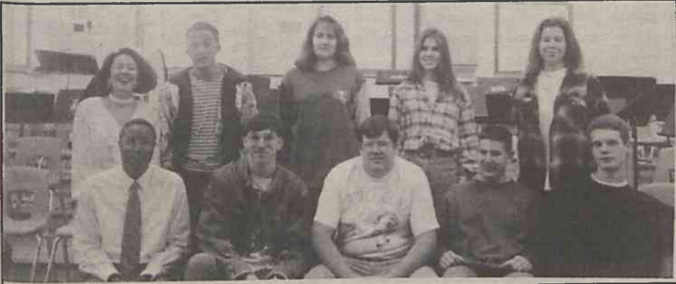
Governor's School nominees get ready for interviews and auditions.