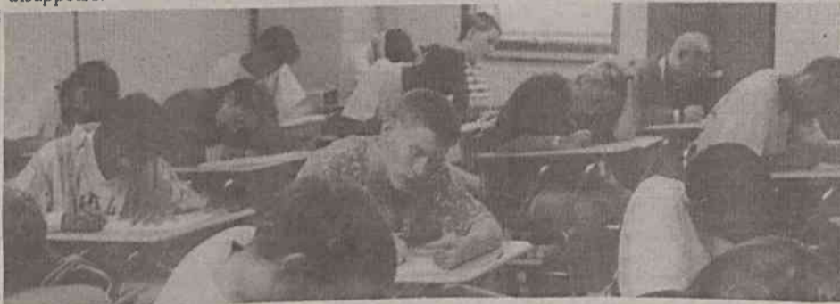
Writing ransom notes is a good source for Christmas cash.

The spirit of Christmas is in hearts everywhere. Children's eyes are filled with images of Segas, Super Nintendos, and Power Ranger action figures while older kids look forward or at least hope to get a new car or stereo from "Santa Claus." Many people are also looking forward to helping others during the holidays while also making mucho dinero. Santa helpers, elves, gift wrappers, and many other jobs keep students occupied during the winter holidays. Students have also found the warm hearted feeling that comes with helping an elderly person decorate for Christmas. If you have never had a Christmas job or helped anyone out during Christmas, you should try it. You'd be suprised at how fast it gets you into the Christmas spirit and also how fast any Scrooge in you disappears.