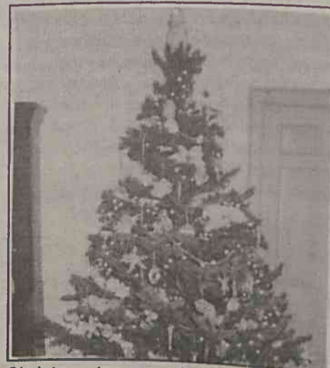
Christmas trees are the all time favorite tradition.

tion? Many people do not know the answers to these questions. Some people think Christmas trees serve as just a pretty place to put their presents, but others know the real reasons for this pine-scented holiday pastime.