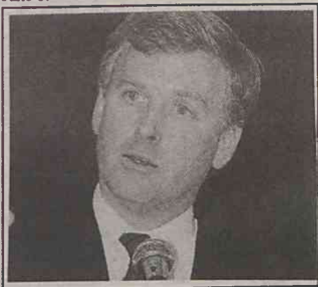
Dan Quayle, graduation speaker.

We all look forward to Mr. Quayle's speech on June 6!