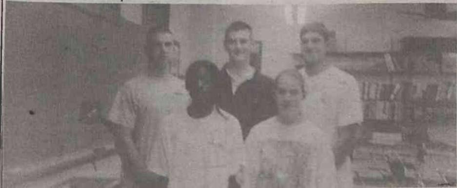
These students are the first participants in the Stanly County Youth Leadership Program.

AHS congratulates these five student leaders and wishes them the best of luck in the upcoming futures as leaders and representatives of AHS.