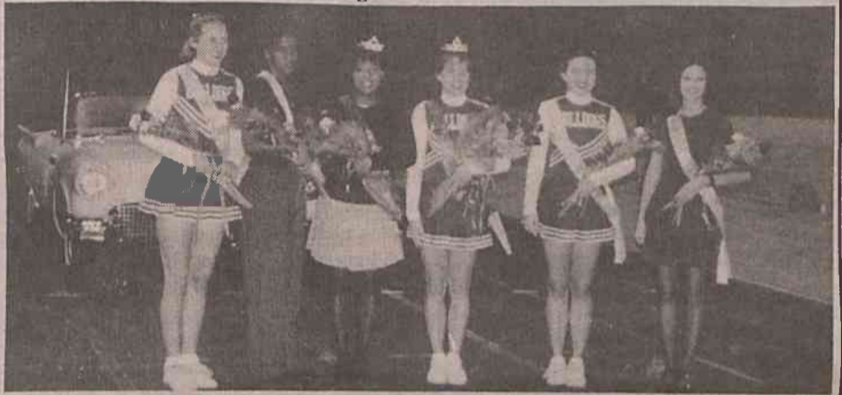
The homecoming court shows off their winning smiles.

AHS congratulates the two queens, the football players, sponsors, escorts, and varsity cheerleaders for a successful '95 Homecoming.