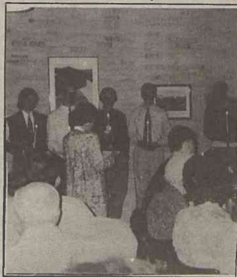
Last year's inductees are planning the ceremony for new members.