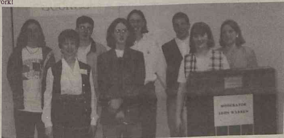
The 1996 Quiz Bowl Team

Good luck to the Quiz Bowl team members in their future competitions. Keep up the fantastic work!