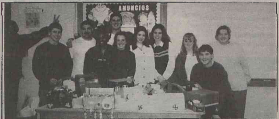
These students smile happily with their winning Spanish "coches."