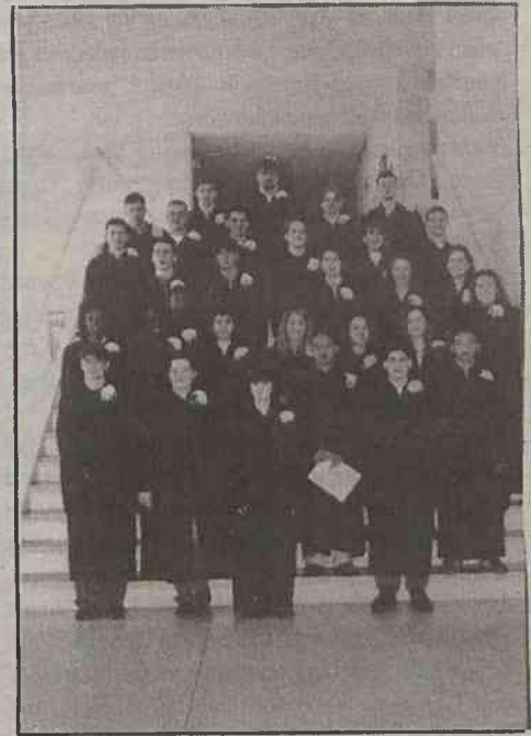
Thirty new members of the National Honor Society were inducted on March 17, 1997.