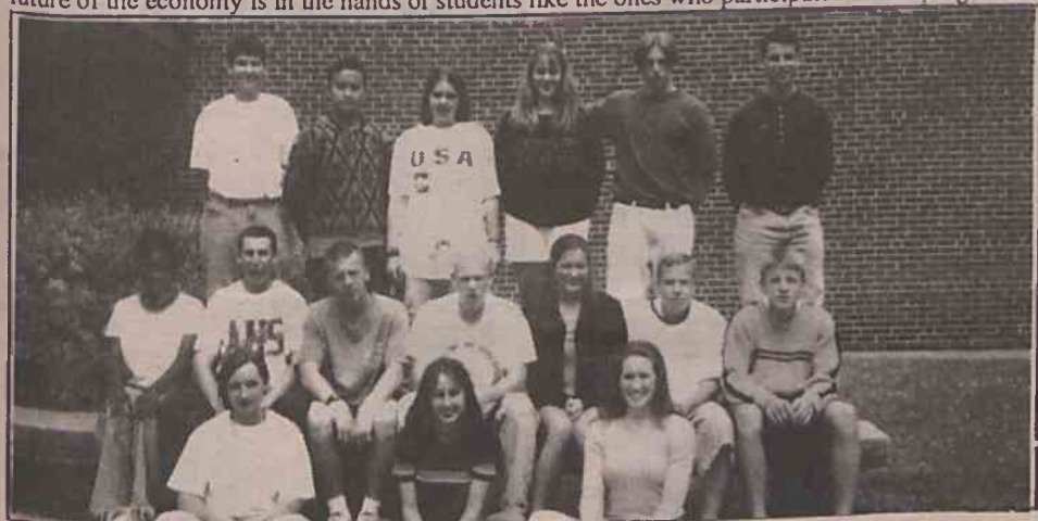
These sophomores and juniors attended the Economics in Action program for a hands-on experience in economics.

The Economics in Action program is beneficial to students who want to own a business. The future of the economy is in the hands of students like the ones who participated in this program.