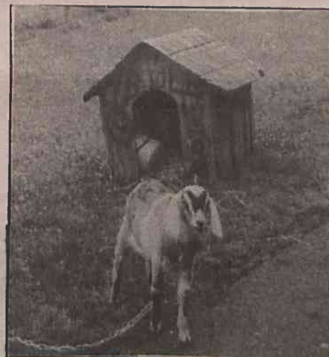
Meet Gilbert Dodford, honorary member of the Class of '97.