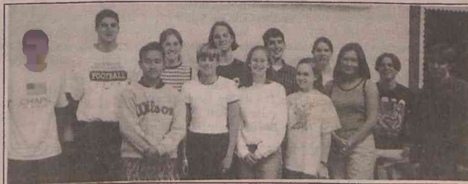
New inductees of Spanish National Honor Society.