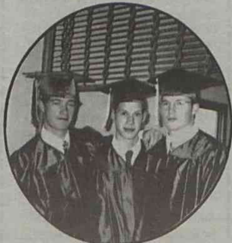
These seniors can't wait to get outa here!