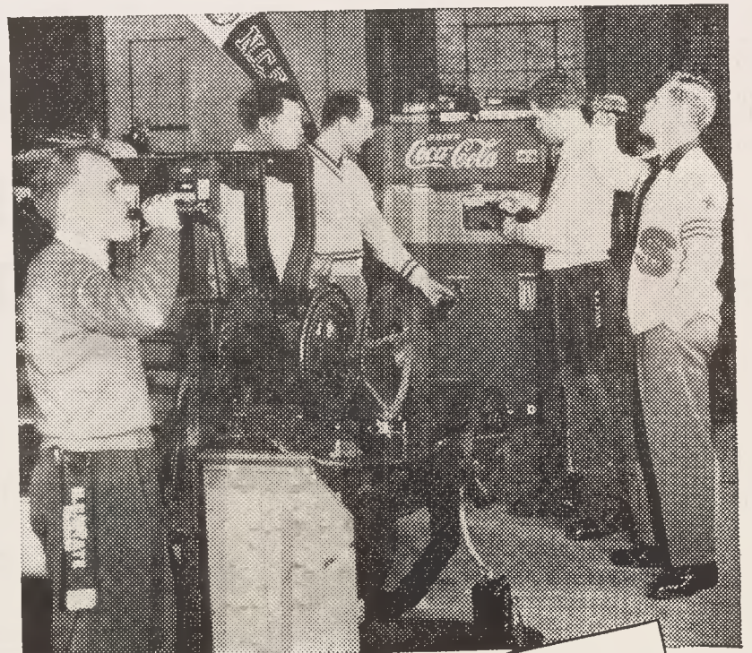
Textile Department North Carolina State College