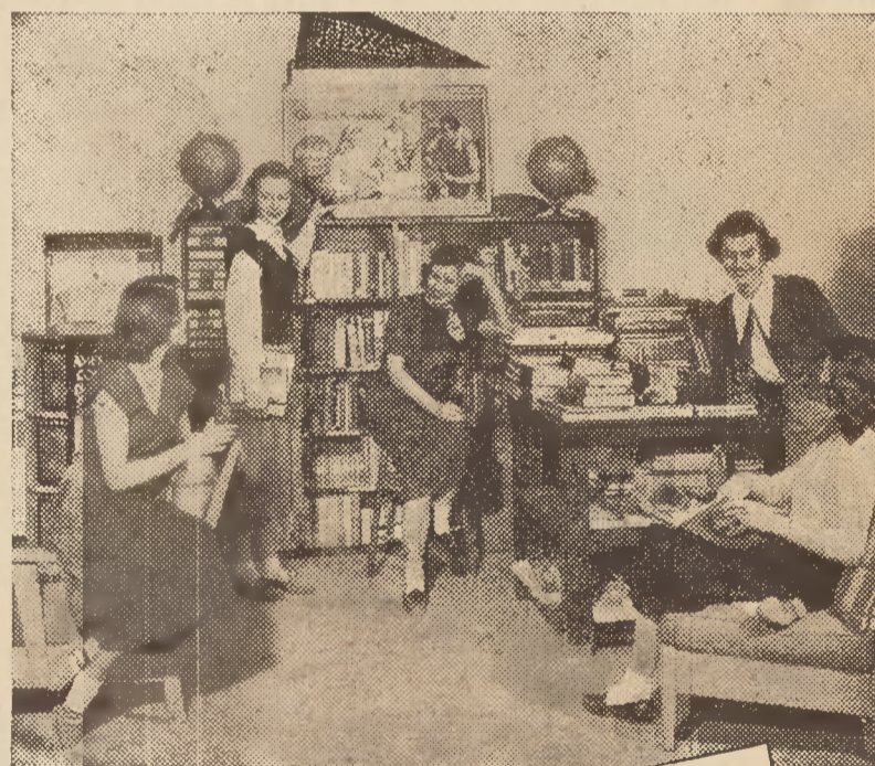
Book Store Texas Technological College Lubbock, Texas